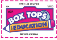
Old Box Tops