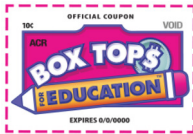
Old Box Tops

Are you longing for something more? Have you ever asked yourself, "What is the point? Why do I exist? What am I doing here?" The answer does not begin with who we are . . . but Whose we are. We belong to Jesus. Not as His slaves, but as His heirs. Slaves are burdened carrying many things. Heirs walk in freedom. Come join us to understand how to surrender your burdens to Jesus and accept your identity as a beloved daughter. Ladies, come find rest within the Heart of Jesus. Come and receive the peace and joy your Heavenly Father desires for you. All women welcome at all locations.