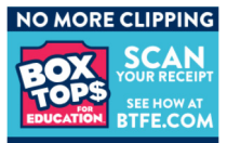
New Box Tops

Tops for Education during the fall contest. The proceeds support the enrichment assemblies for all the students. Contact Christina Wulpi at 246-2009, with any questions.