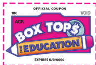
Old Box Tops