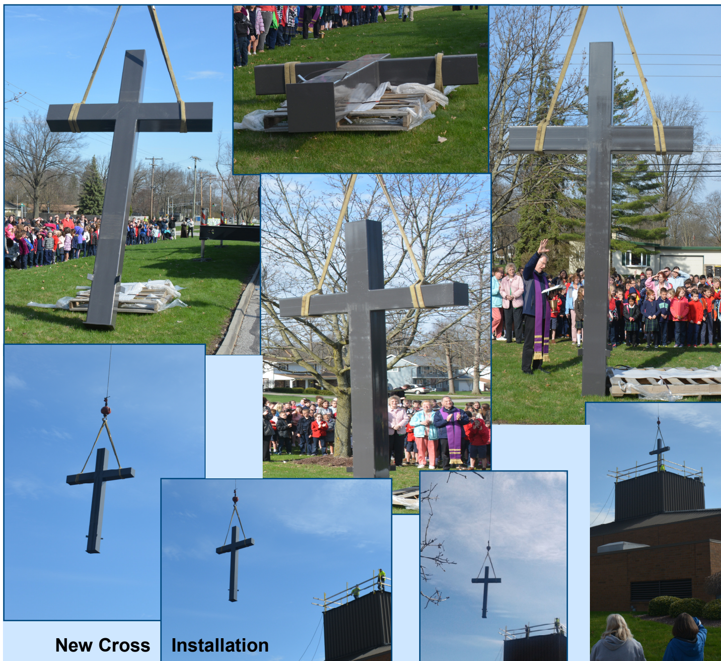
New Cross Installation