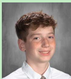
Allen County Non-Public Schools Assn.