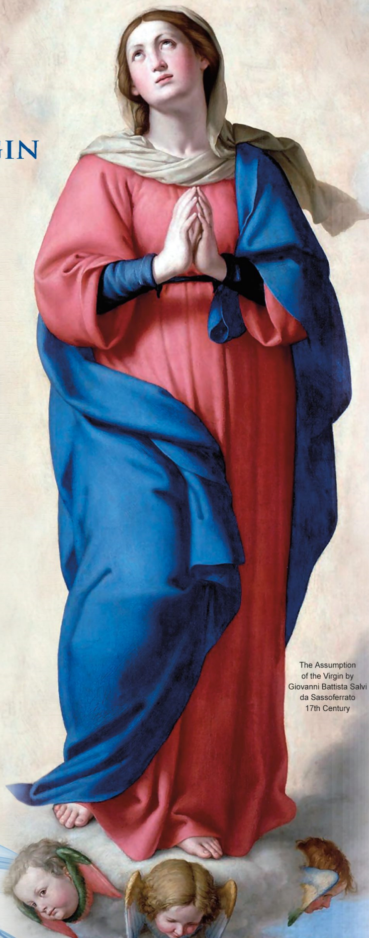
The Assumption of the Virgin by Giovanni Battista Salvi da Sassoferrato 17th Century