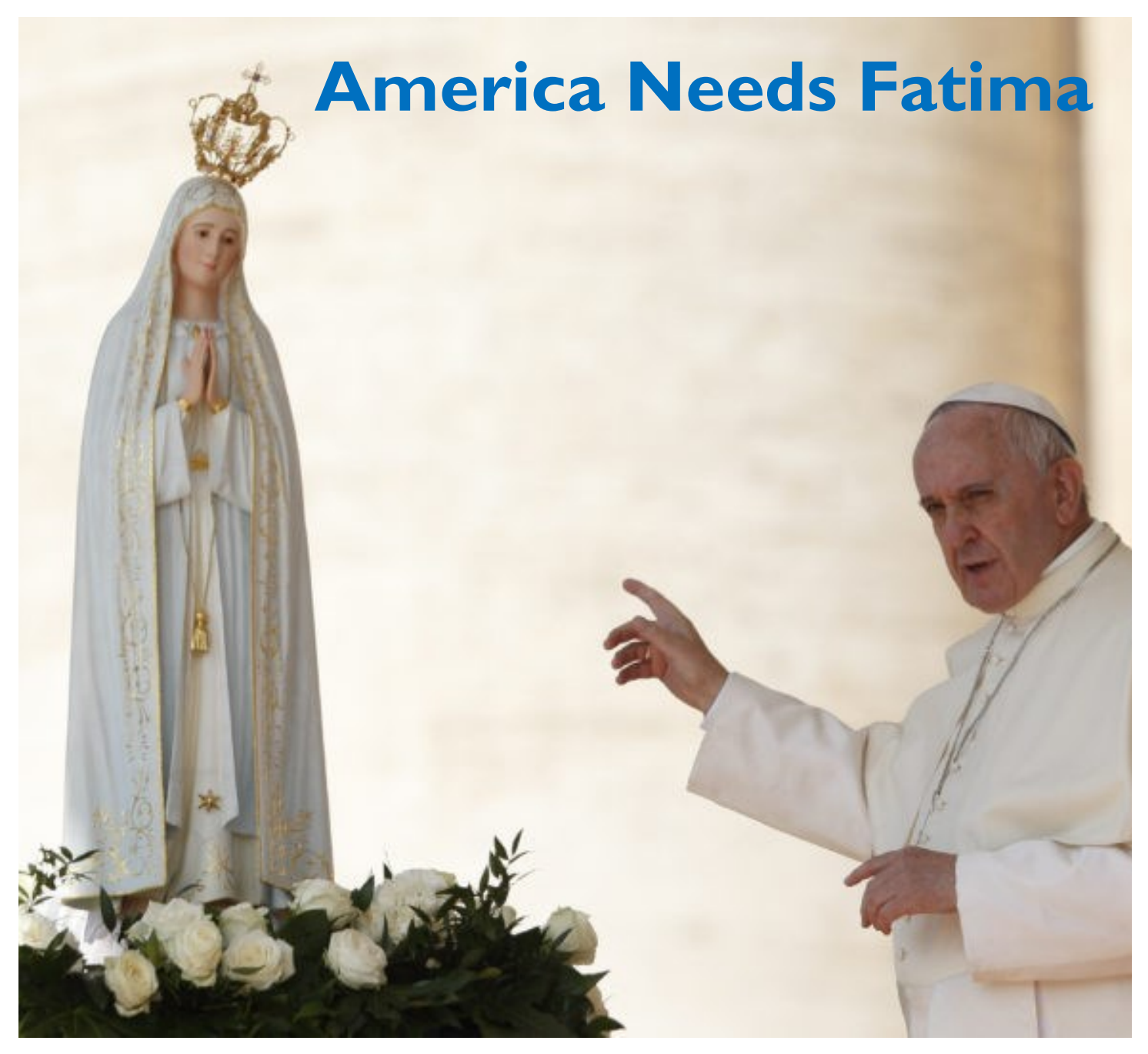
"Finally, My Immaculate Heart Will Triumph!" June 13, 1917, Our Lady of Fatima

Please come join the 2019 public Rosary Rally! October 12, 2019 @ 12:00 Noon