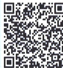
PHOTO SESSIONS WILL BE HELD THE FIRST HALF OF AUGUST.

SCAN THE QR CODE TO SCHEDULE YOUR FAMILY'S PHOTO APPOINTMENT.