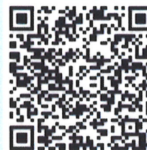
PHOTO SESSIONS WILL BE HELD THE FIRST HALF OF AUGUST.

SCAN THE QR CODE TO SCHEDULE YOUR FAMILY'S PHOTO APPOINTMENT.