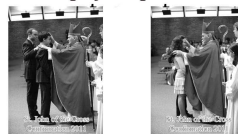
Stand behind the Confirmandi not next to the Confirmandi