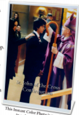
This Instant Color Photo is supplied in a clear plastic frame