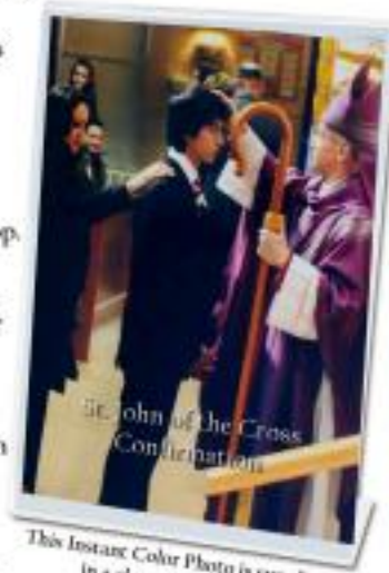
This Instant Color Photo is supplied in a clear plastic frame

Tom Killoran Photography Instant Event Photos 11316 S. Harlem Ave. Worth, Illinois 60482 708 361 0025