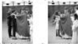
Stand behind the Confirmandi not next to the Confirmandi