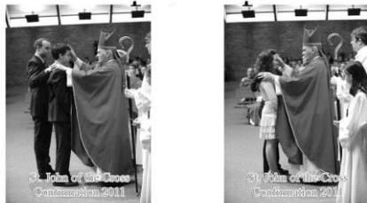
Stand behind the Confirmandi not next to the Confirmandi