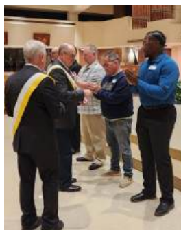
Candidates are presented with their Rosaries