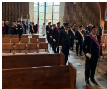
Honor Guard leading in the candidates