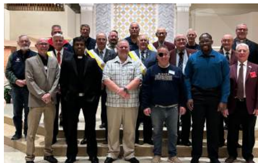
New 3rd Degree Knights with the Council 451 Exemplification Team and other brother knights in attendance on November 21, 2025