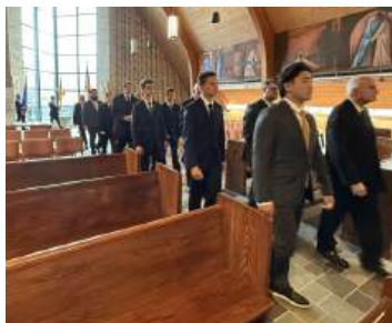
Candidates processing in for the ceremony-

Nov 9, 2025 the 4th Degree held an exemplification at St. There's Little Flower church in South Bend. They received in 21 new Sir Knights to the 4th Degree.