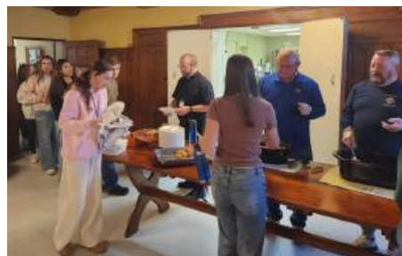
Teens going through serving line.