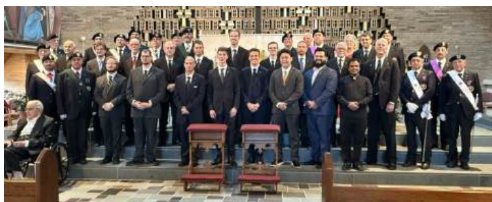
Group picture of new Sir Knights and Honor Guard and other 4th Degree members.