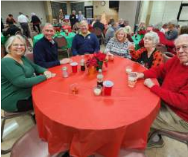
The many tables of happy attendees!