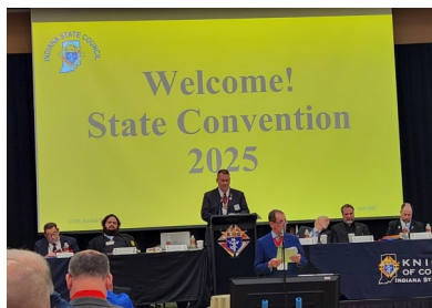
Opening and welcome to State Convention on Saturday morning