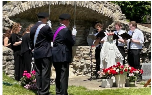
Closing hymn with honor guard