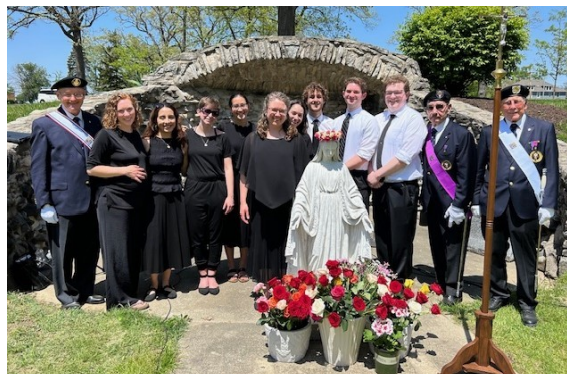
The Ecce Youth Choir and Fourth Degree Honor Guard