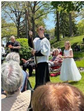
Procession to the statute of Mary