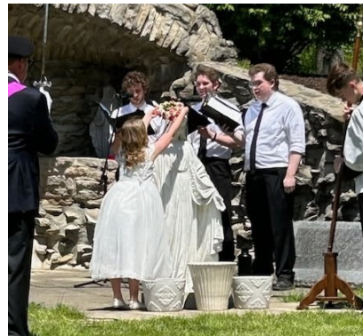
The statue of Mary is crown to the tune of "Queen of the Angels, Queen of the May"