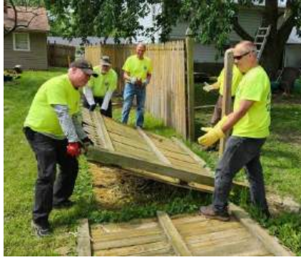
Hauling a section in place.