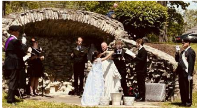
Crowning of Mary Our Mother by first communicant.