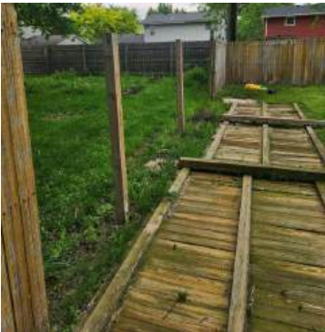
A portion of the fence at the start.