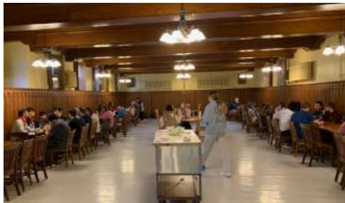
The dining hall at St. Felix for those who have never been there.